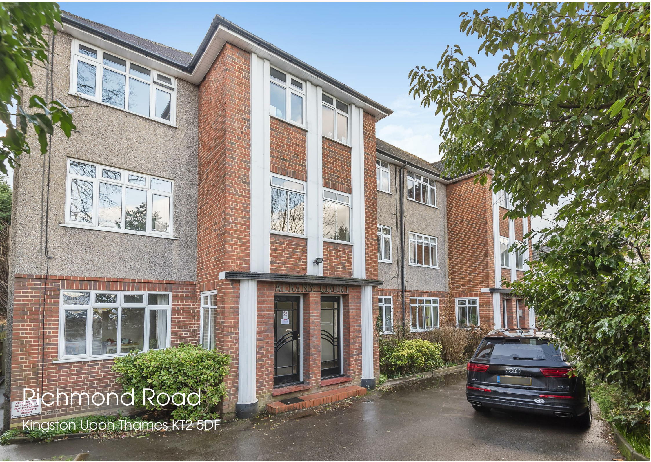
Richmond Road Kingston upon Thames KT2 5DF